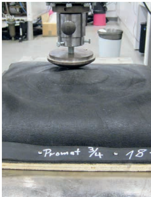
Figure 4: Measuring the deformability